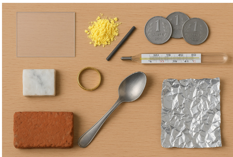
Fig. 1. A display of everyday objects for students to classify. My display had a piece of hard plastic, some sulphur, the graphite rod from a pencil, some coins, a piece of marble, a gold ring, a steel spoon, a piece of brick, a mercury thermometer, and some aluminium foil. Students were invited to observe and handle these objects before classifying the material they were made up of as metals or nonmetals.