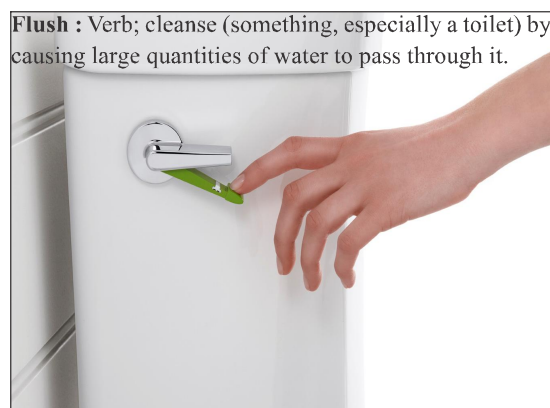
Figure 3.1. Screenshot from the glossary of the SLEND

It is clear that while the concept of a green bio-toilet might be European, the instructional poster reveals its local situatedness (e.g. gudka [sic] covers). The text led to a discussion on the new vocabulary, including a video of explanations, which were added to the SLEND. Figure 3.1 shows the entry for “flush”.