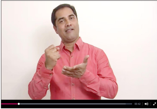
Figure 3.2. Screenshot from the glossary of the SLEND

There is a threefold input in this case: the word has a textual explanation in English including its grammatical category, followed by an illustration of the activity of flushing a toilet and a sign language explanation of flushing (see Figure 3.2).