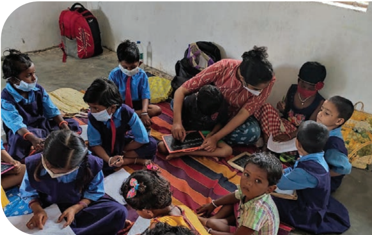
Mohalla class at Bangar

With the worst of the second wave behind us, our field visits resumed in June 2021. The work was split between teaching and helping with the vaccination drive. As part of Project Amaright, I visited the villages of Charra, Kokdi and