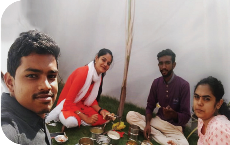
Lunch with my mentors

same enthusiasm as we shared stories from the Mohalla classes. As the meal progressed, we also discussed lesson plans for languages and mathematics.