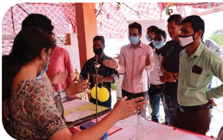
Snapshot of the TLC fest at Kurud

fests. This was also a good opportunity to learn from and observe teachers from different schools and their approach towards classroom teaching.