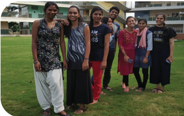
Visit to the Dhamtari District Institute