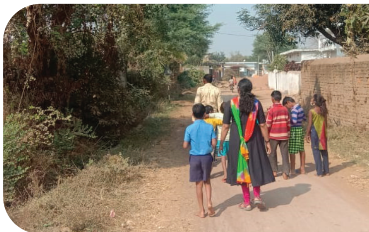
Surveying plants with students

more than one school in a cluster. On the last day of the fest, students exhibit the findings of a project undertaken by them under the supervision of teachers. The subject of the project could be anything from the history of the village to the study of water table.