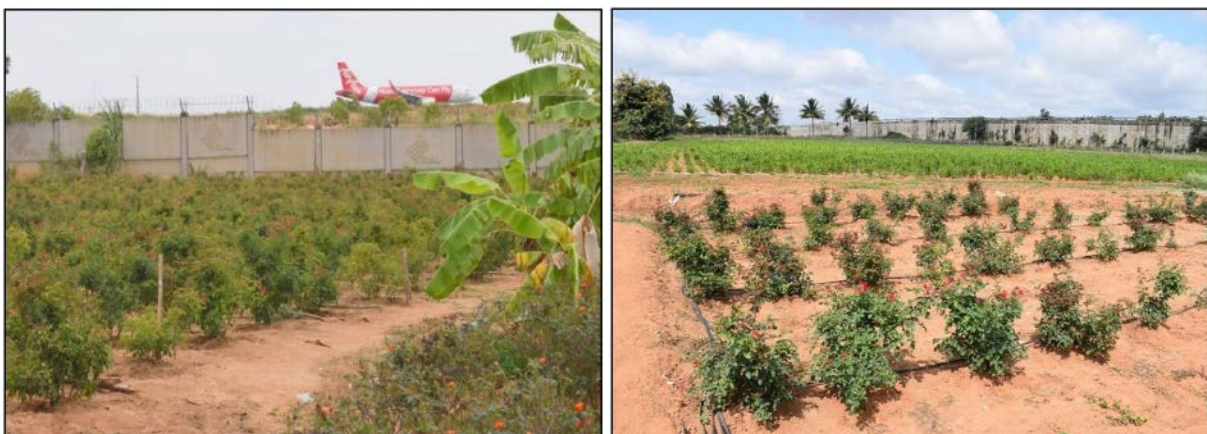
Figure 1: Intensive cultivation of roses in patches of farmland remaining just outside the airport boundary wall.

Flowers are not completely new crops to the area. But they too changed in their kind, practices followed and area cultivated. Fields of humble Kanakambara ( Crossandra ) - a flower of low value but high local demand - gave way to demanding and pricey rose plants in the drip irrigated patches (Figure 1). Kanakambara and Kakada (a variety of jasmine) were the two popular flower crops when land was not a major constraint for the farm families. Rain-fed floriculture of Crossandra , jasmine or cheaper roses by small holders targeted temples, households, festivals, social events and weddings. The micro patches of land left after acquisition and the homogenization of flower cultures across cities brought high value rose varieties to the periphery of Bengaluru airport. It was aided by the spread of bore well and drip irrigation systems (subsidized by the government) using the compensation money. Farmers with somewhat larger holdings cultivate flowers like chrysanthemum and marigold. International Flower Auction centre located closer to the city on the airport road exports large volumes of cut flowers, during December to March.