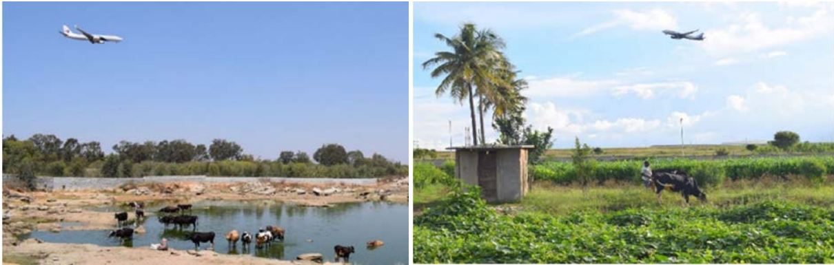
Figure 2: Airport came up on grazing commons and farmlands.

Health and wellbeing appear to be the cost incurred by almost all families, though it is tough to directly attribute this to loss of farmland and commons. Seasonal fruits and vegetables in the common lands and fish from the overflowing keres (lakes) used to be gathered freely. Lack of such common sources of nutrients, decline in the area under ragi and decline in the number of farm animals could be driving nutritional insecurity in these villages. With the exit of ragi from the cropping pattern along with the spread of government food security scheme - AnnaBhagya from 2013, rice started occupying a dominant place in the local diet.