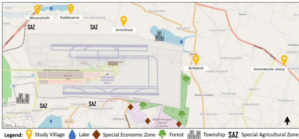
Map 2. Airport and study villages (2019).