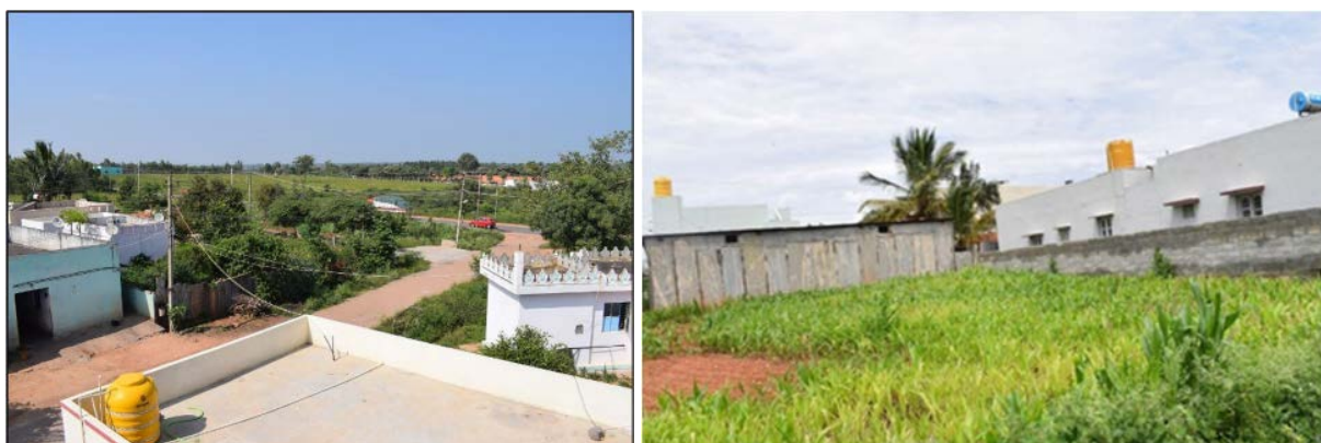
Figure 3: Resettled colony displays an undying aptitude for agriculture, among the displaced farmers.

Airport authorities have been extending support to the villages around by renovating school buildings, building water storage structures, and providing small ruminants to poorer families. Somehow Arasinakunte colony, the settlement to which evicted families were relocated, seems to be out of sight for such flow of support.