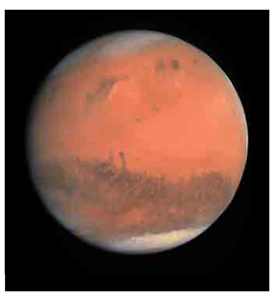
Fig. 3. Can other planets sustain life? How do we colonise other planets? These are just some of the questions that are interesting to many people, across different age groups.

Do what you can to make sure that students read extensively - including biographies of scientists. Badger, if you have to, your school administrators to take students on trips to good libraries.