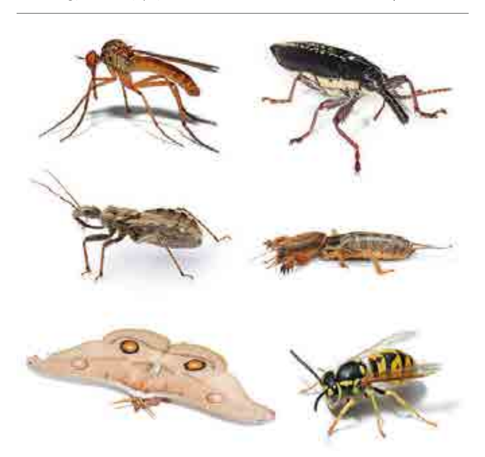
Fig. 2. What causes the immense diversity we see among insects? Getting your students to ask how nature works can do wonders.

Oh, so important! Observation is absolutely fundamental to science. Sticking to teaching strictly from textbooks is the issue, maybe even the