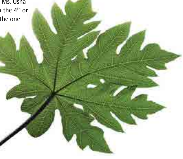
Fig. 1. Why does the leaf of a papaya plant have this shape? Bringing things from outside to use as props in your class can make science classes more engaging.

own world, and talk to themselves — things of that nature. Another is that we are one-dimensional, potentially boring people, who are interested in nothing but science. This is definitely not the case — certainly not for me, or for the many other scientists that I know. I need the arts, interaction with