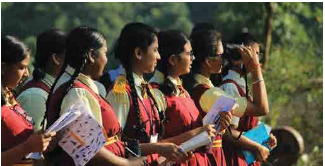
Fig. 1. A large part of my work focuses on nature education.

I've been in love with plants and animals for as long as I can remember. As a teenager, I would pore over every issue of a BBC Wildlife magazine sent over by a family friend. I would also watch countless episodes of Jacques-Cousteau's programme on marine and underwater life on Doordarshan. But, having never met a wildlife biologist or conservationist in real life, I did not think that it was possible to build a career in this field, especially in India. So, for the longest time, my fascination for wildlife remained limited to my interest in the books, magazines and documentaries I could get hold of. Then, one day, I spotted an advertisement by a Bangalore-based organization seeking volunteers interested in spreading awareness about wildlife and conservation. This was a turning point in my life. I was enrolled in an undergraduate programme in Commerce, but spent summer breaks