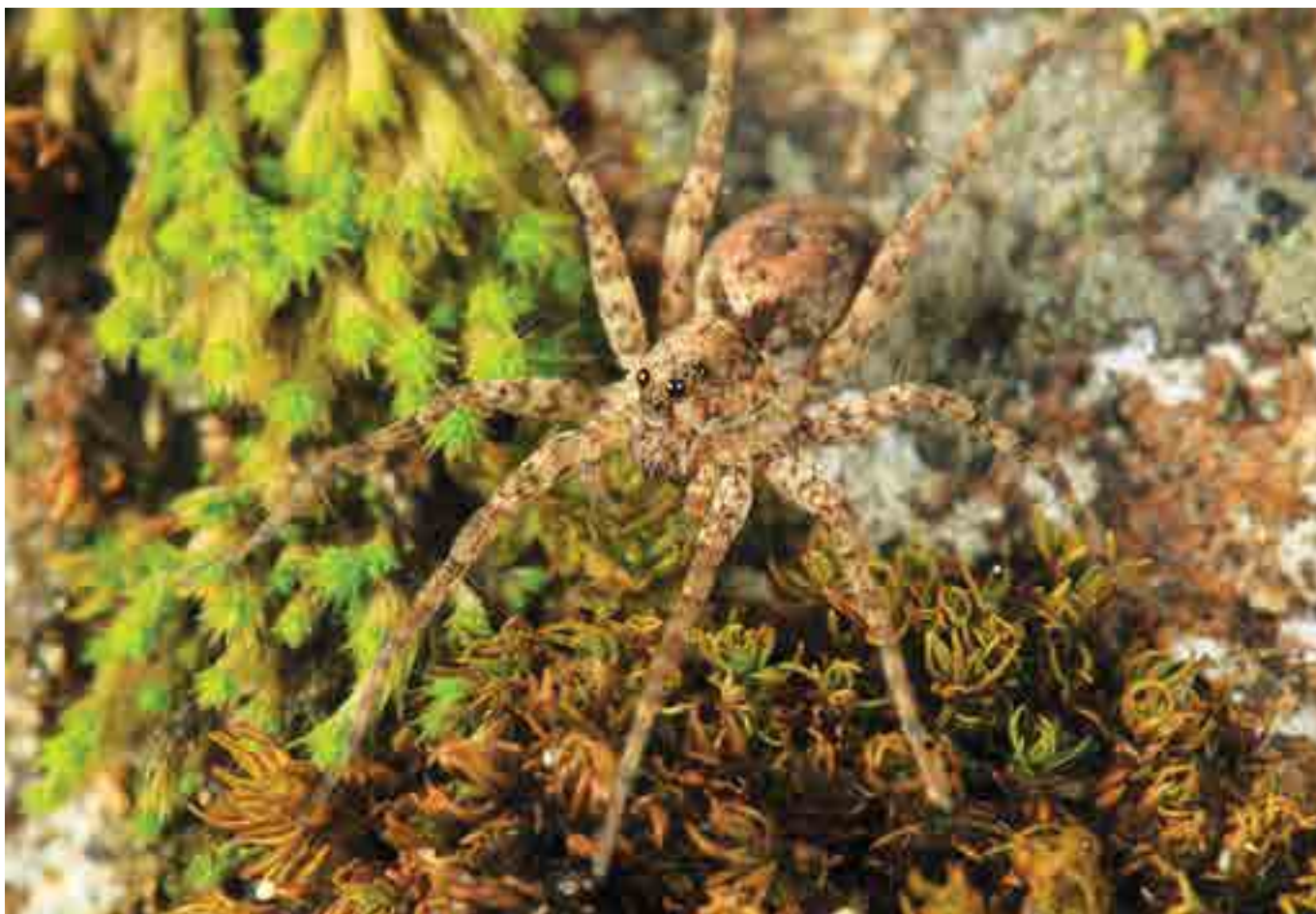
Fig. 3. My first job involved research on spiders from the Western Ghats.

Credits: Sara. License: Commissioned and copyright image used with permission.