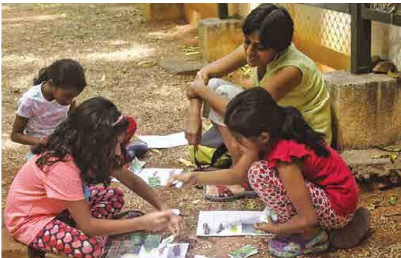
Fig. 4. It is important to encourage children to develop a connection to nature.

While this is an important step in recognizing the necessity to sensitize children and young adults to environmental issues, many of us in the field believe that the way the EVS component is framed and delivered has made it a burdensome additional