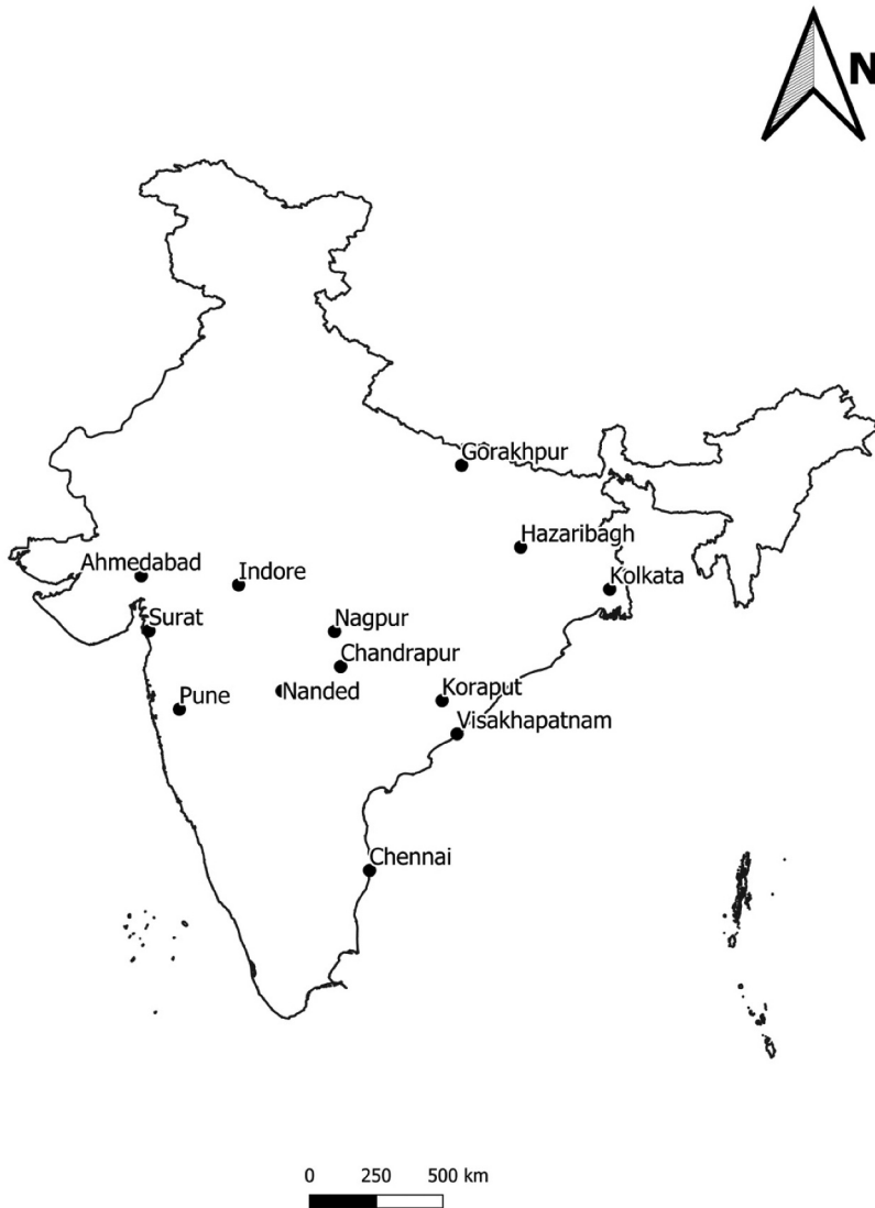
Figure 1. Cities for which urban climate plans were studied.

We mapped city plans into six categories – heat action plans, resilience strategies, carbon-neutral cities, environmental status reports, city development plans, and disaster management plans. These plans take different forms. Some plans, such as those of Nagpur, form part of larger comprehensive development plans; others such as the heat action plans of Surat and Ahmedabad were initiated by local municipalities to prepare for risk events. Six were evolved in response to external initiatives such as the Rockefeller Foundation’s 100 resilient cities programme (Karanth & Archer, 2014).