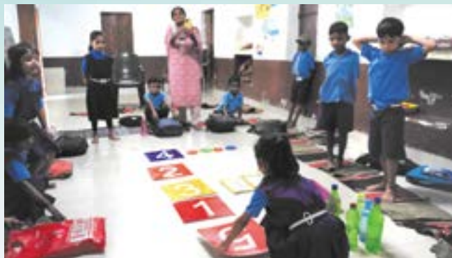
Figure 1. It is important to involve students in 'maths talk'.

Here, I used a fraction kit to compare various fractions with like numerators.