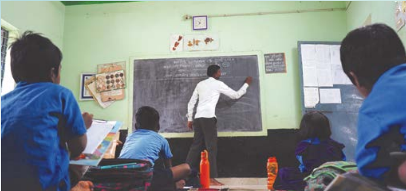
Figure 1. We need to involve students in their learning process.

lacking — we were not involving students enough in their own learning process.