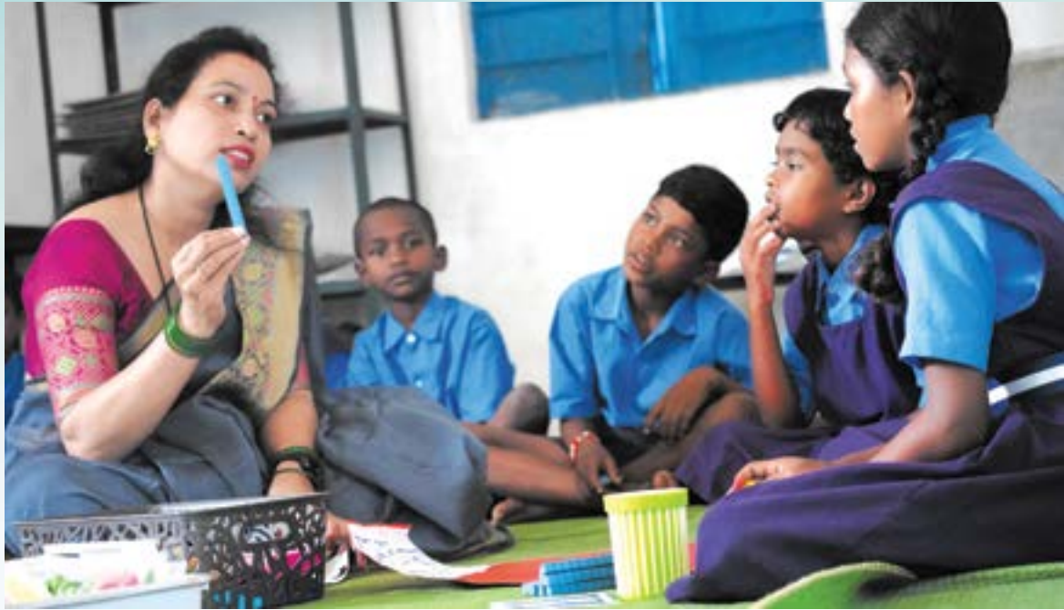
Figure 1. The practice of moving from conversation to writing has proved to be highly valuable.

him to come to work. I told my father, “You go, I will teach my brother!” My mother had a fever, and she was not able to do the housework. I told her to rest, and that I would make rotis.’