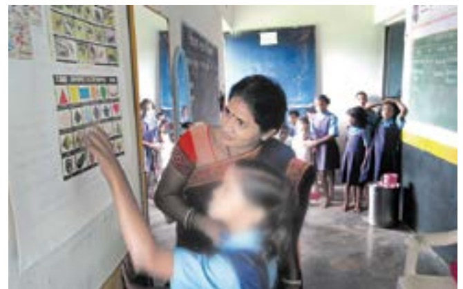
Figure 1. The most important step in understanding a child's difficulty is to do it with sensitivity and an intention to help.