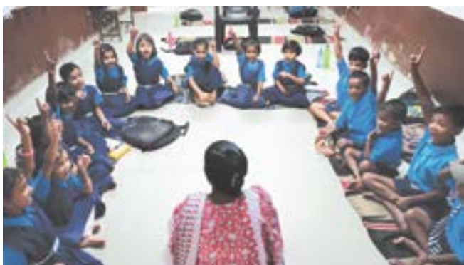
Figure 1. An environment of cooperation and collective learning rather than that of competition works best.

Students began to feel the pulse of rhythm by learning simple 4-beat patterns like 1, 2, 3, 4 ( Teen Taal ), or 8-beat patterns like 1, 2, 3, 4, 5, 6, 7, 8 ( Keherwa Taal ).