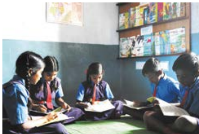
Figure 1. Students feel more at ease with stories outside their textbooks.

the name of their favourite colour, movie, or city and then write it on the board. Everyone would scurry to the blackboard, and the excitement and joy in the classroom reached new heights.