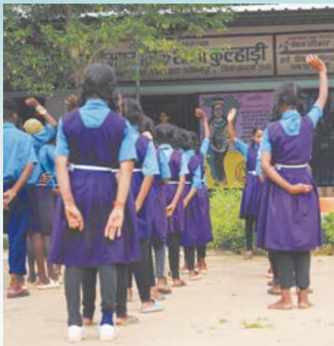
Figure 1. Morning assembly can be used effectively for developing awareness on issues such as health and wellbeing.

The play was staged in the morning assembly. The children watched with great interest and grasped the key message behind clean, safe and nutritious food. They were also asked to review the play. After this, they were presented with questions on the topics highlighted in the play, including nutrition, health, good food, clear and dirty water, cleanliness of hands, the summer season and the importance of food. For instance, 'For which disease did the doctor prescribe medicines?', 'Why was it required to visit the doctor?', 'Why was the outside food contaminated?', 'What arrangements were made for water storage at the wedding?', 'How was the spinach cleaned before preparing the spinach dish at the party?', 'If a mother were to prepare the food instead, what cleaning arrangements would she make?', 'How do we deal with leftover food at home, and what do you think happens to leftover food outside?', etc.