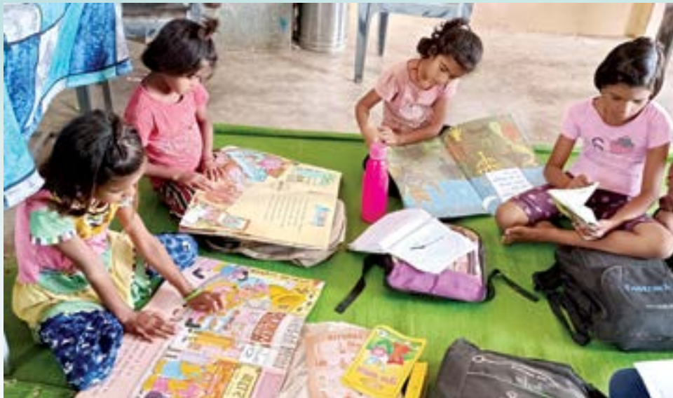
Figure 1. Reading, making and talking about stories, helps students' writing skills.

Song writing began by sharing a song in class: 'Happiness is something if you give it away ...' We listened to it, clapped along, and gradually each group built their own class version by substituting key lines. I guided the class in identifying the song's pattern and tone. We sang the group versions aloud, which made the learning joyful and memorable. I selected one group poem for class editing and discussed whether it followed the pattern and conveyed the intended message. Finally, learners wrote their individual songs. It was remarkable to see how even struggling learners attempted full stanzas with