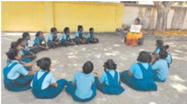
Figure 1. Stories help children develop empathy.