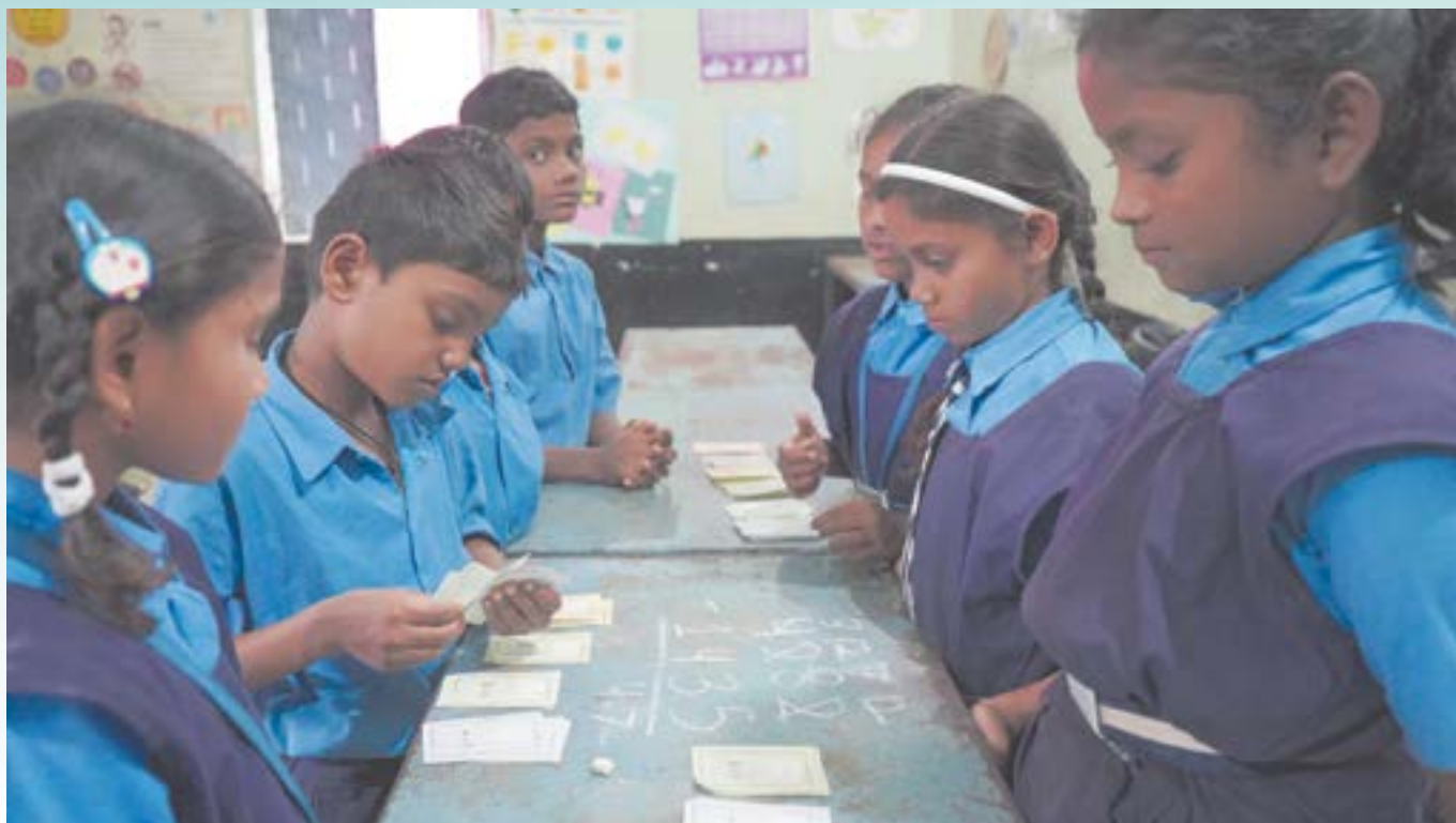
Figure 1. Children learn by using TLMs.

They performed addition and subtraction like this: