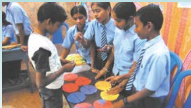
Figure 1. Students showcase learning by doing in a learning mela.

When I realised this, I started trying to bridge this language gap. I spoke to the children about the whole lesson in their local language. For discussing metals and non-metals, I chose words that they commonly use in daily life. For example, to explain the word 'metal', I spoke about iron, steel, brass, gold, silver, etc and told them that all these are called metals, whereas plastic and rubber are not. Other words from the lesson, like hammering ( kuchna in their dialect) and sheet ( chadra in their dialect), were also discussed. We all know that whenever we hear a word, a mental image forms in our minds. If a word does not create any image or picture, we can never truly understand it. Perhaps this is why it is said that even in science, it is important to teach children in a