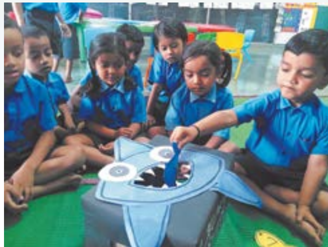
Figure 1. Teachers can create simple TLMs from locally available materials.

From my experience, I understand that TLM helps improve children’s attention and focus. When they look at a game or a picture, or engage with an activity involving TLM, they learn more effectively and retain information better.