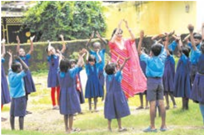
Figure 1. Children can cross their physical limits if given suitable opportunities.

I spoke to them individually and tried to understand what was going on in their minds; what was the reason that they avoided games that typically children enjoyed. That is when it became clear that because of their physical appearance, they were caught in a loop of self-consciousness and inferiority. They also feared being teased by other students.