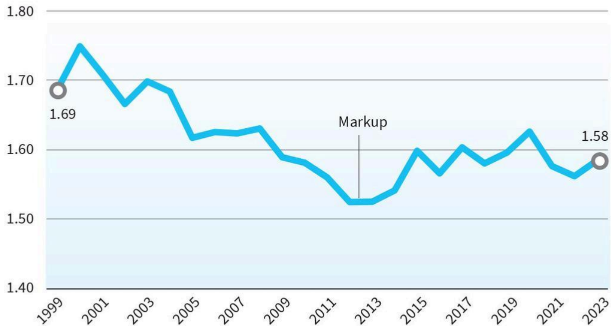
Chart 4: Chart shows the ratio of nominal sales value to that of nominal variable cost for non financial corporate firms