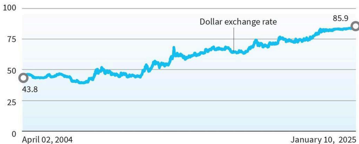
Chart 1: Chart shows the dollar exchange rate in India (in ₹)

In the post-COVID period, particularly between the latter half of 2022 and November 2024, the RBI momentarily shifted its policy stance to a regime that closely resembles the fixed exchange rate regime. This is reflected by the flat segment of the dollar exchange rate in Figure 1 during the relevant period. Deterioration of the current account deficit and capital outflow during this period were met by selling foreign exchange reserves while holding the nominal exchange rate more or less at the same level. The sharp devaluation of the rupee in the last month or so hints towards RBI returning to its earlier regime of the managed-float exchange rate that it followed during the 2010s. Responding to greater capital outflow